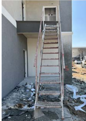
Upper railing missing